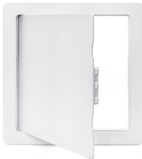
Wall Access Panel Sample (if wires are inside the wall)