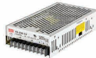
Our most common transformers we use for LED Illuminated Signage Projects